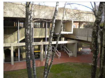
1Permission for use of Image, Jack Pyburn