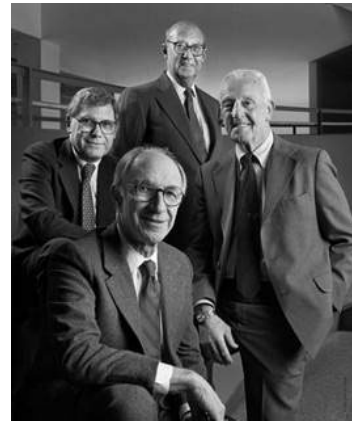
Permission for use from Robert Geddes

The professional team that produced the PPHQ was exceptional individually as well as collaboratively. The individual significance of the team members is summarized below.